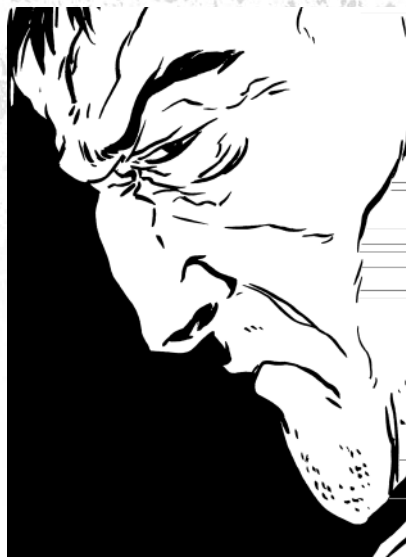
Bishop Justin at'Rox

If the PCs follow Lord ir'Lumm's request, they'll wait for the lord and the bishop in the dinning room. The PCs may attempt to eavesdrop on any conversations the two men have before they enter the dinning room. Unless the PCs sneak closer to the conversation or use